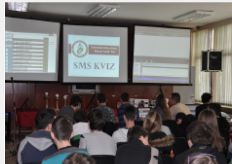
The school organises Tesla Info Cup, an annual competition for primary school pupils that takes place online or via text messaging

The cooperative's profit will be invested in materials and study tours, as decided by the cooperative's governance bodies, in which all members have equal voting rights, irrespective of their status in the school.