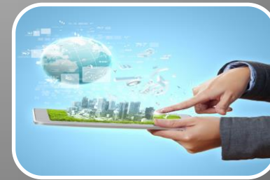
The digital society