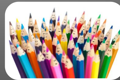
Focus on equity and quality

Need to invest in education for better outcomes