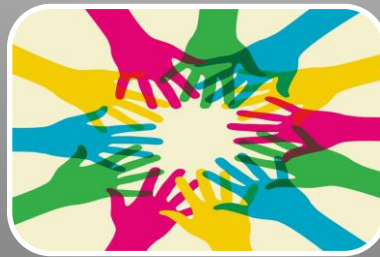
More diverse communities